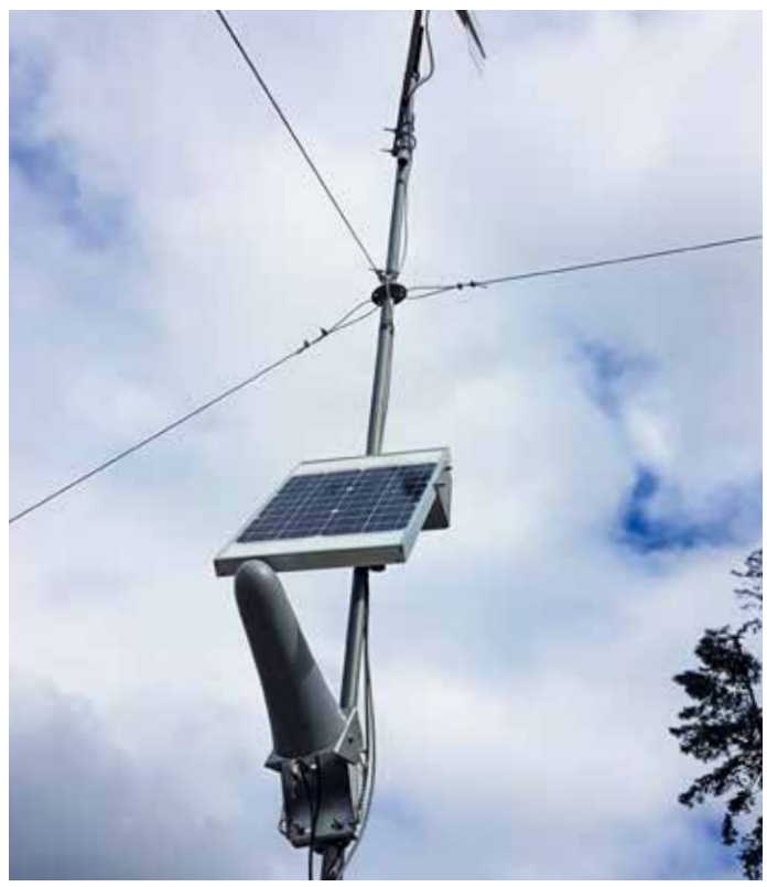
Weather stations across our forest lands collect and transmit real-time fire weather data that guides our forest management decision making.

Mosaic's fuel management program is another important tool in preventing wildfire. We manage fuels (potentially combustible material in the forest) in various ways, including chipping, on-site burning, and the sale of firewood cutting permits. Every year, Mosaic donates funds collected through the sale of firewood cutting permits and doubles it through a matching contribution to a deserving community organization.